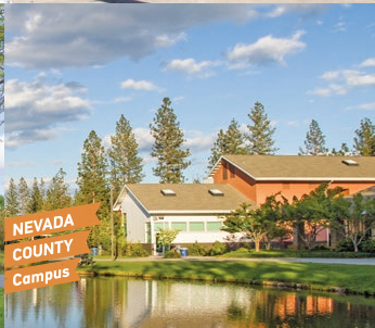
NEVADA COUNTY Campus