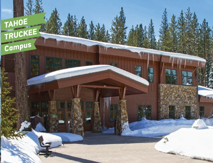
TAHOE TRUCKEE Campus